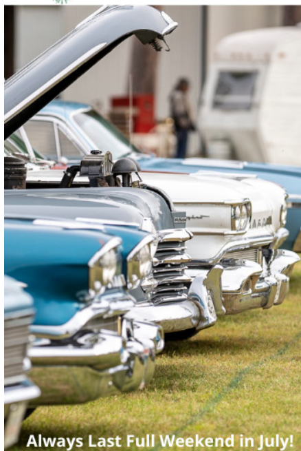
Always Last Full Weekend in July!

May 15th is the last day for early registration, rates increase next week. Did you get your spot yet? If not, we do have spaces available. Call today 218-326-6619